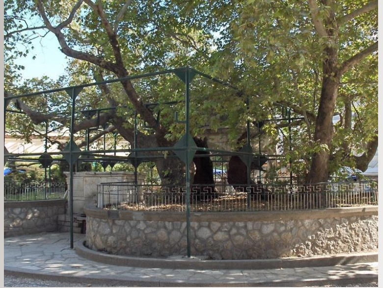
The original Tree of Hippocrates in Kos, Greece