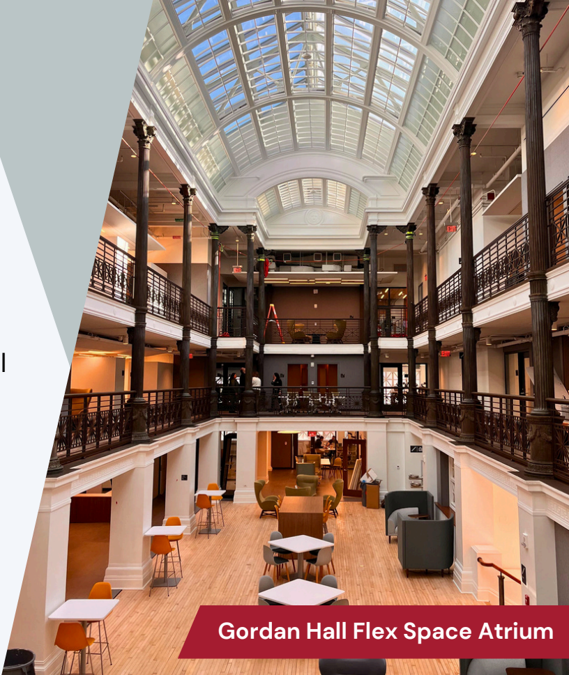
Gordon Hall Flex Space Atrium

Through purposeful design and flexible offerings, we create an adaptable environment that seamlessly bridges remote and in-person experiences, promoting both individual and shared goals. By cultivating cross-departmental collaboration and a strong sense of belonging, we redefine what it means to work together in a modern, supportive, and dynamic setting. With the Gordon Hall Flex Space opening expected in March, it's clear that flexibility, collaboration, and individual focus are at the forefront of this exciting new initiative.